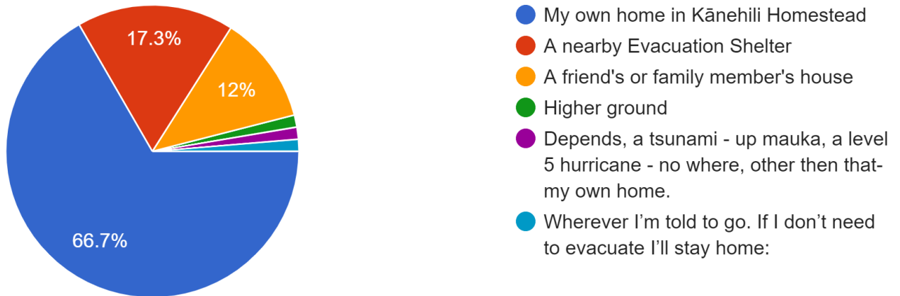
Figure 1, May 2021